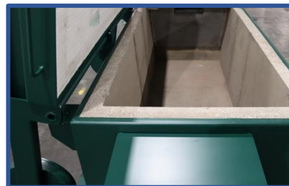
AIS 033 Cyclone Main Chamber View

* Burn Rates dependant on usage and waste type and may be subject to your local regulations. Speak to a member of our team for more information.