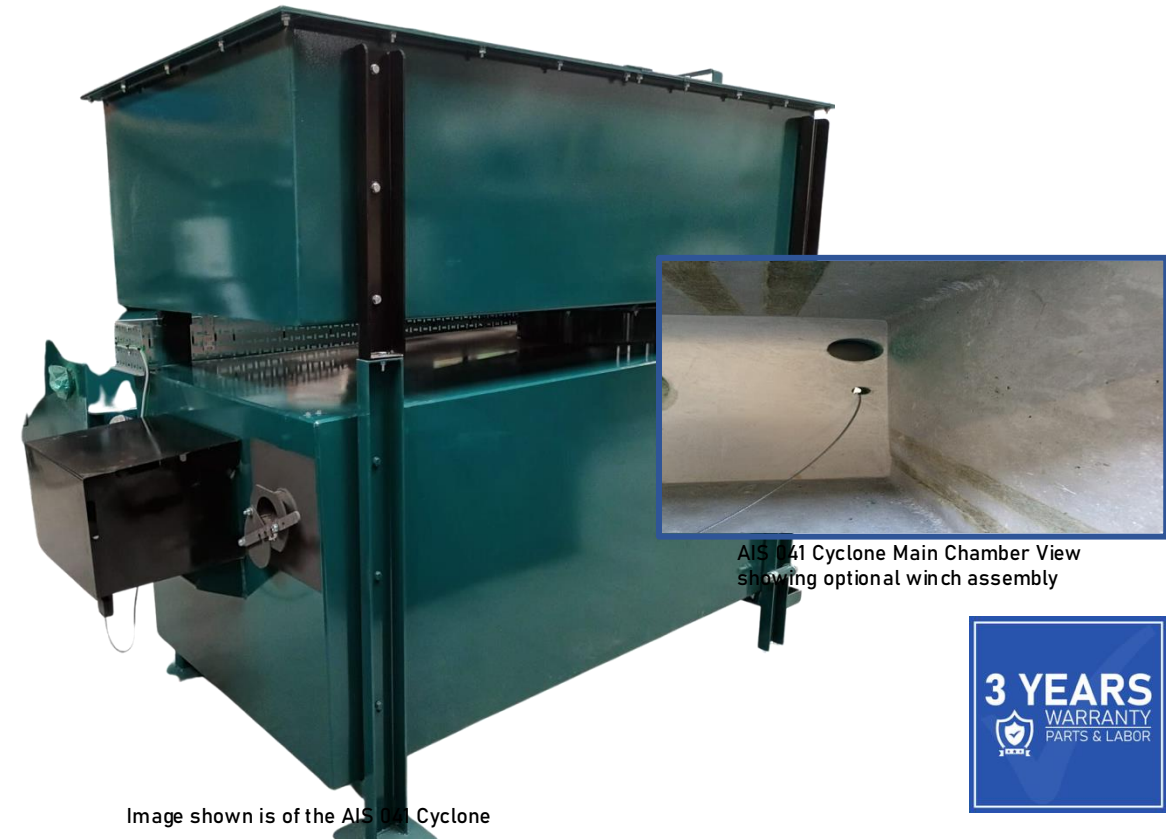
Image shown is of the AIS 041 Cyclone

* Burn Rate may be subject to your local regulations. Speak to a member of our team for more information.